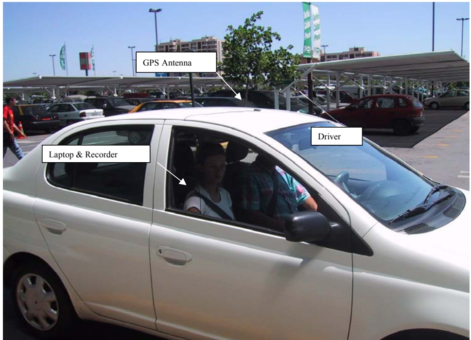
Figure III.1: GPS Instrumented Vehicle in Santiago, Chile

partners should identify up to six 2-wheelers and drivers to participate in this study 4 . Figure III.1 shows a passenger vehicle equipped with a GPS module as used in Santiago, Chile. The CGPS units do not require an operator or laptop computer. Thus, only the driver is necessary.