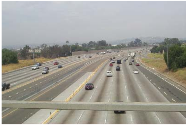
Picture of the Freeway Below